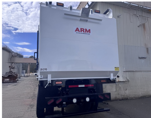
25 CUBIC YARD CAPACITY